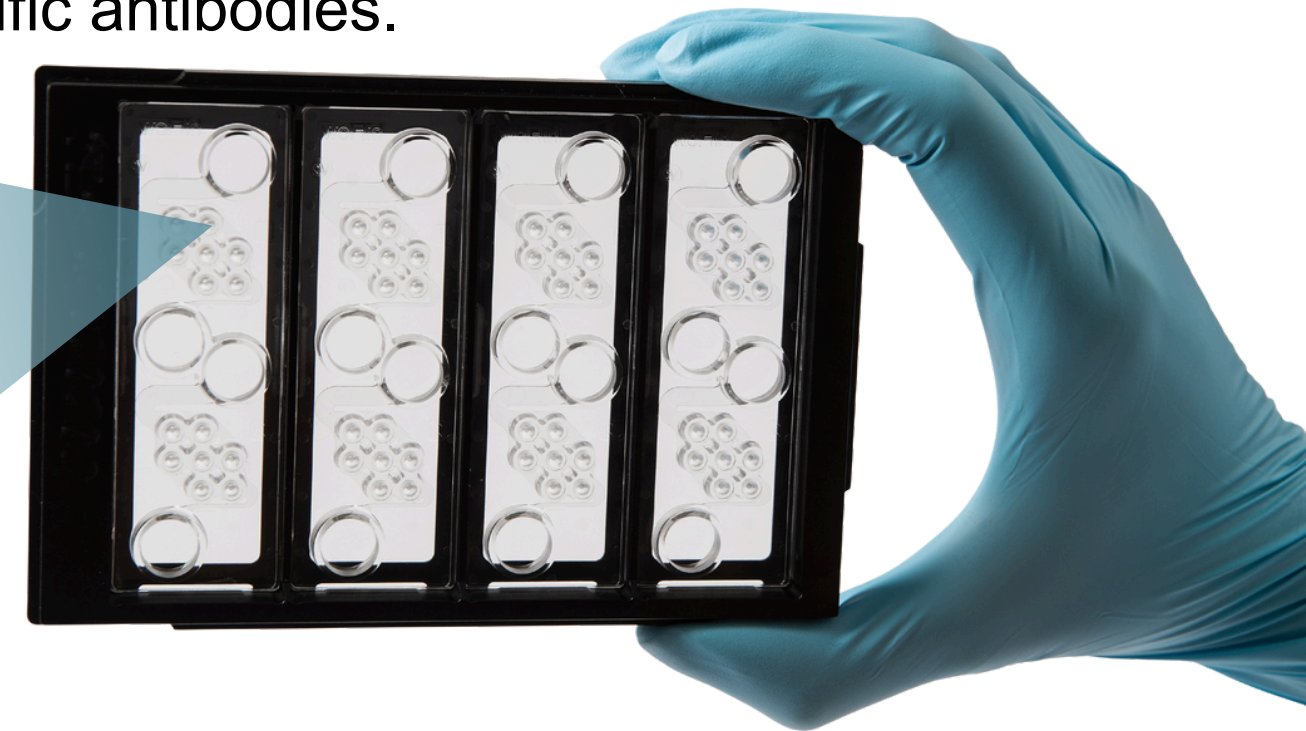
Akura™ Immune Flow Organ-on-Chip Platform